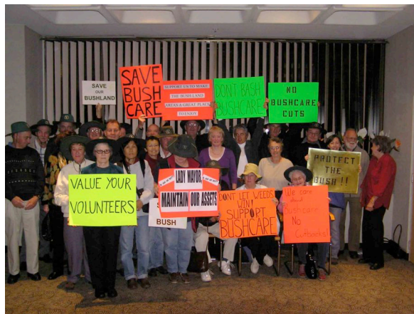
Bushcare Volunteers make their views known at the Council meeting of 26 May 2005.

So, be prepared for a continuing campaign and see inside for suggestions on how you can get more involved.